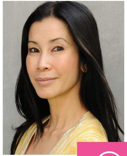
LUNCHEON KEYNOTE Lisa Ling

Fresno Convention & Entertainment Center